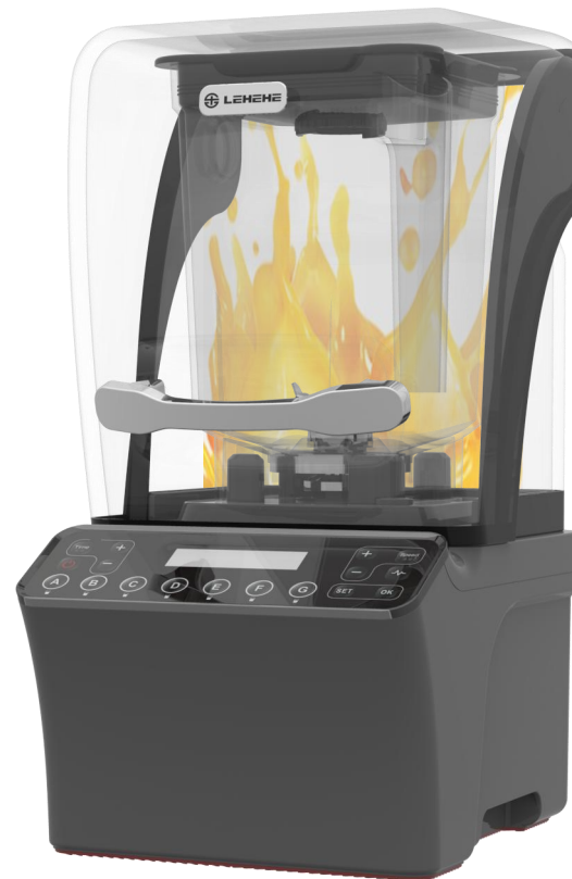
E8D Intelligent Blender