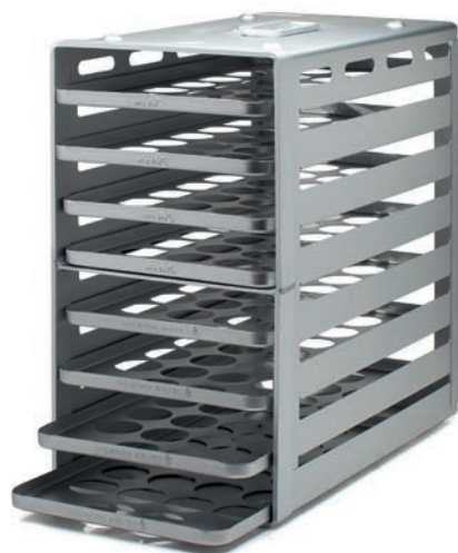
Oven Rack 8 trays