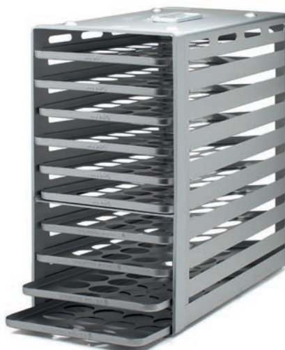
Oven Rack 10 trays