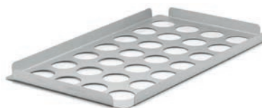
Spare tray with open corners